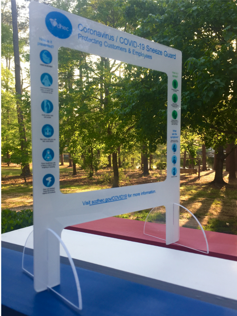
Option: Customized with your logo, design, or message. (Lexan legs shown.)