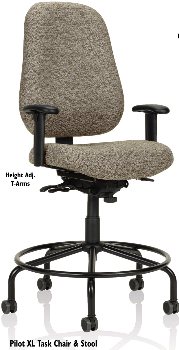
Height Adj. T-Arms